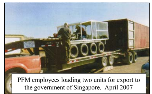
PFM employees loading two units for export to the government of Singapore. April 2007